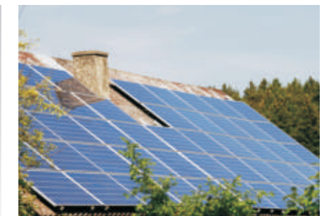
Solar Combiner Box